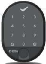
Wireless Fingerprint Reader With Keypad